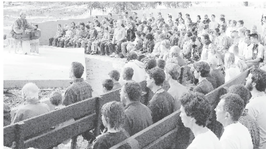
Participants at SRF Summer Youth Program, July 2006, commence their morning meditation singing one of Paramahansa Yogananda’s Cosmic Chants accompanied by harmonium.

If your children squirm during meditations, before meditation you might play a different game. Ask them to sit in meditation posture, and explain that you are going to tickle them under their chins with a feather or silk scarf. See if they can continue to hold the correct meditation posture while they are doing this. Then let them test you! Afterwards, have a short meditation, challenging everyone (yourself included) to sit just as still as they did during the game. Short exercises like these introduce fundamentals in an enjoyable way.