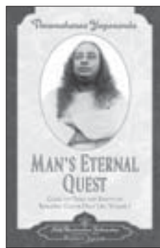
MAN’S ETERNAL QUEST VOLUME I Hardcover No. 1601 $24.00 Quality Paperback No. 1602 $16.00