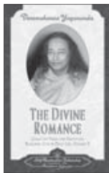
THE DIVINE ROMANCE VOLUME II Hardcover No. 1625 $24.00 Quality Paperback No. 1626 $16.00